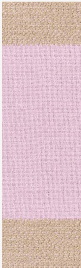
Reflex 639 - A6174

GOLRAN Shadowy white, 01G M85, cm. 200x300