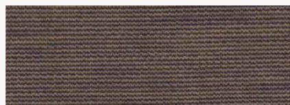
Uniform Melange Oil - A8100