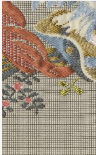
Madame du Barry 30083 - A7799