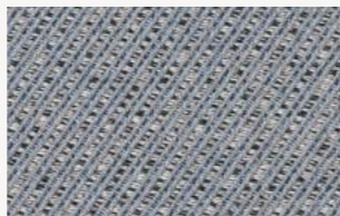
Masai 142 - A8347