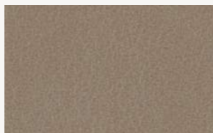
Leather Blush cirè - B218