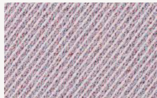
Sirocco 611 - A8401